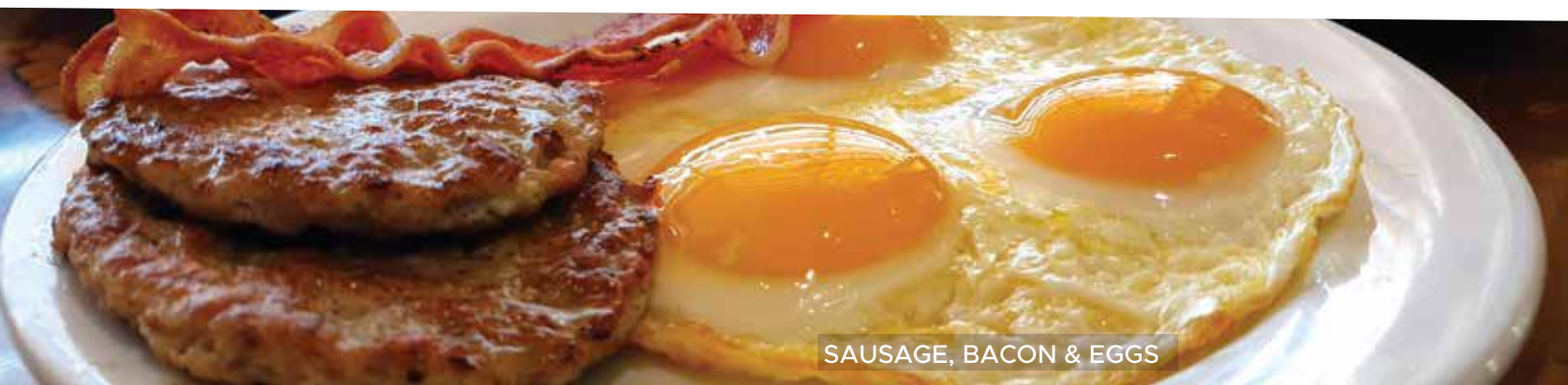
SAUSAGE, BACON & EGGS