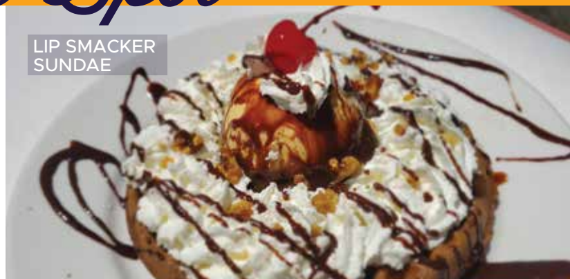
LIP SMACKER SUNDAE

ASK YOUR SERVER ABOUT OUR DELICIOUS PIES