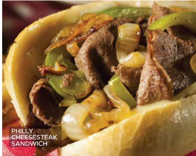
PHILLY CHEESESTEAK SANDWICH

CHICKEN WRAPPED IN A SOFT SPINACH TORTILLA, PAIRED WITH SPRING MIX, DICED TOMATOES, CRUMBLED FETA, AND A CREAMY RANCH DRESSING.