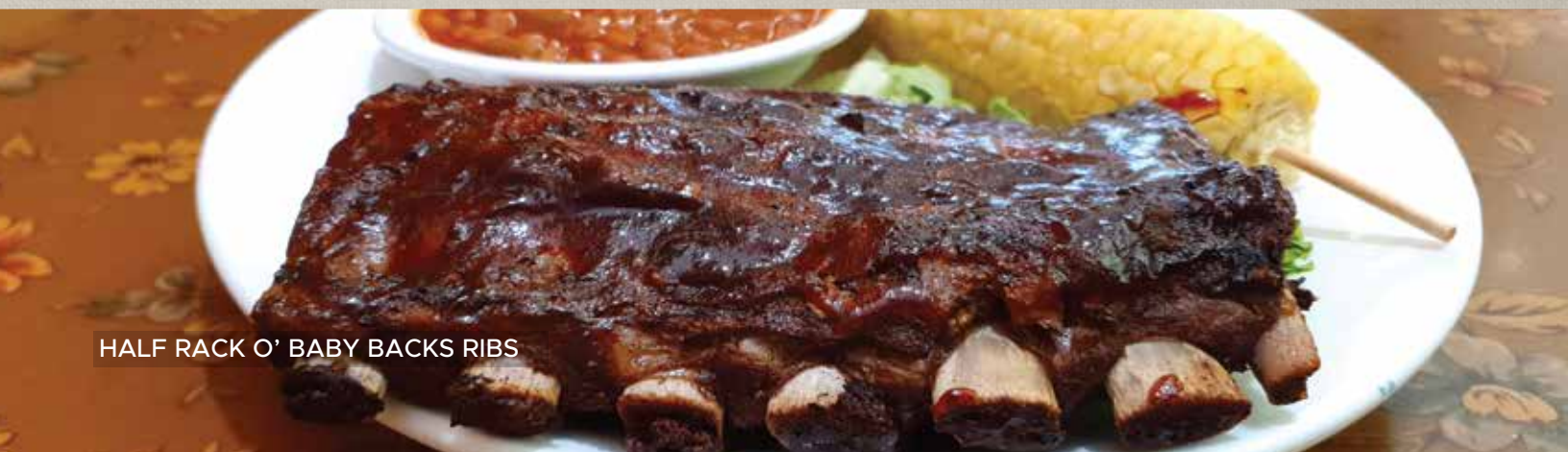
HALF RACK O' BABY BACKS RIBS

FRIED HALF CHICKEN N' HALF RACK O' BABY BACK RIBS. 32.45