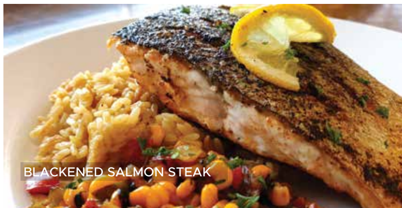
BLACKENED SALMON STEAK

CATFISH FILLET ROLLED IN KORNMEAL AND FRIED, COD BATTERED AND FRIED, AND FRIED SHRIMP. SERVED WITH CORN PUPPIES, TARTAR AND COCKTAIL SAUCES.